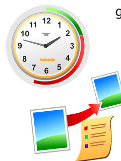
Image Converter Plus supports conversion of a vast variety of raster formats.

We strive for perfection in our work. Error free result is one of the main advantages of the program. Image Converter Plus supports more than 200 formats and more than 800 format dialects. Regardless of the file source website, e-mail, digital camera etc. - you can be sure that your file will be converted and saved correctly. When using your own profile of file conversion, you are protected from any errors. Image Converter Plus will perform the task exactly as specified. Converting files in batch mode also guarantees flawless results on each item within the batch. There is no need to process each file separately in the routine way. Image Converter Plus will quickly and accurately convert a huge batch of files exactly the way you need!